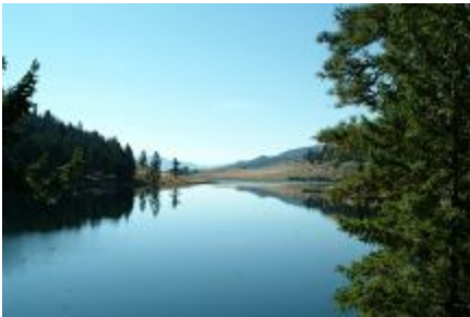
Northern Shore, Chopaka Lake, WA

I have always thought, that if I knew the end of the world was coming, Chopaka Lake is where I wanted to be to watch it happen.