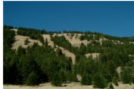
Hillside, Chopaka Lake, WA